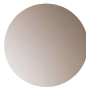
Acabado bronce Bronze finish