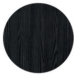
Fresno negro Black Ash